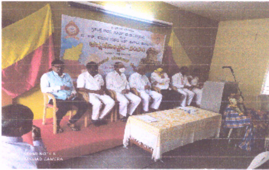
Kannada Rajyotsava Celebration