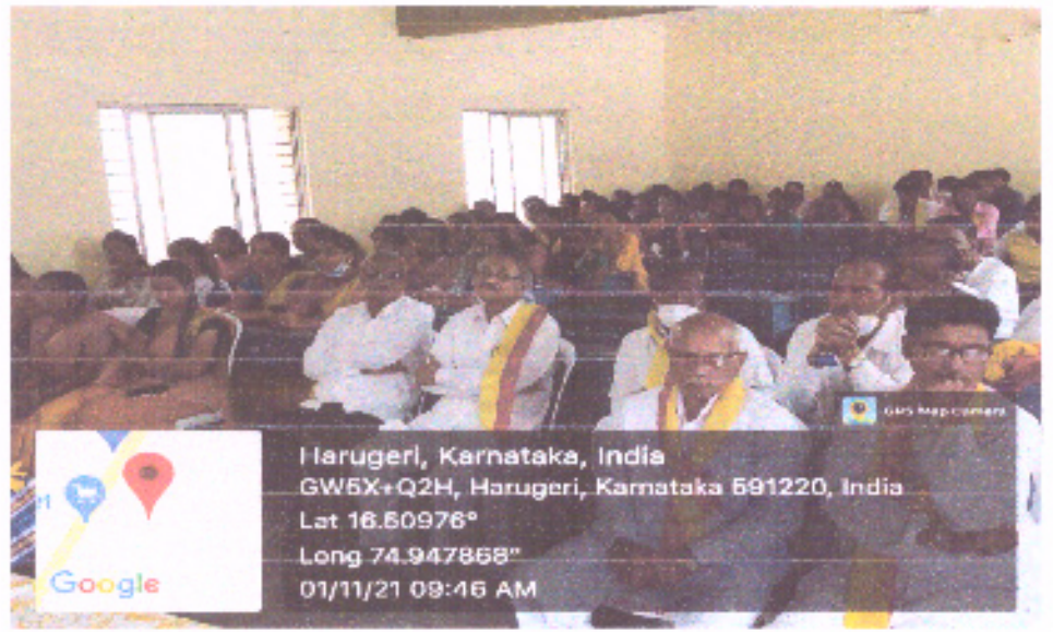
Kannada Rajyotsava Celebration

PRINCIPAL Shri Vrushabhendra Education Society's B.R.Darur First Grade College, Harugeri Tq Raibag - 591220. Dt. Belagavi