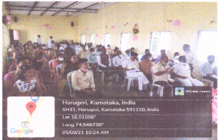
Teacher's Day Celebration