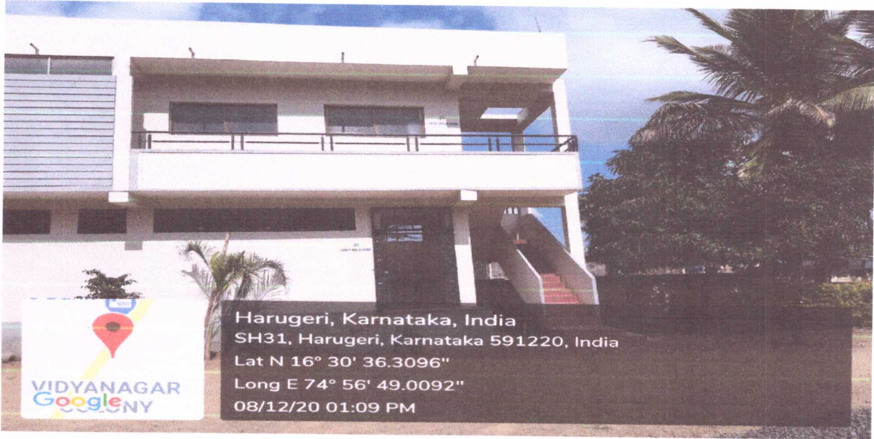
Ladies Common Room Photo 1